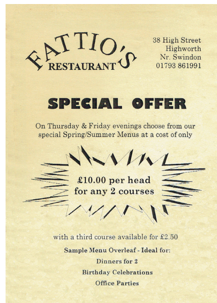
Menu from Fattio's Restaurant

During the year we have been given many items such as the Presentation Trowel to commemorate the planting of the tree at Highworth School (now Southfield) for the Queen's Coronation in 1953, with photographs and information about the occasion.