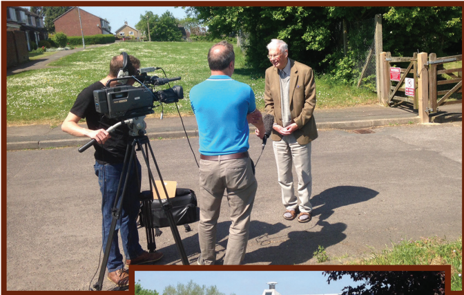
Filming at the Community Centre