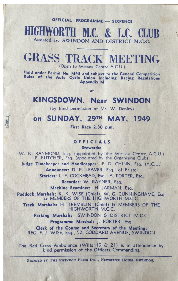
One of our recent acquisitions