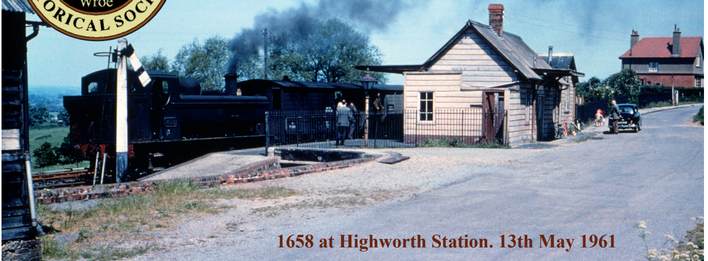
1658 at Highworth Station. 13th May 1961